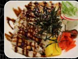
R9. TORI DON $11.80

Pan fried fillet of salmon with teriyaki sauce on rice, served with pickled veggies.