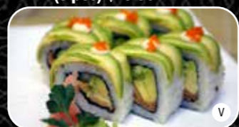
SU15. AVOCADO VEGGIE ROLLS (8 pcs) $10.80