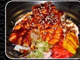
R8. TERIYAKI SALMON DON $13.80

Signature grilled pork belly chashu served with special chashu sauce, flavoured egg, salad, mayo and pickled vegetables.