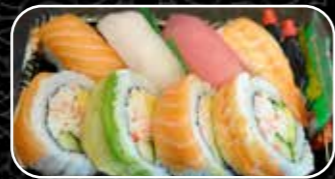
SU5. SEAFOOD DELUXE BOX $12.80