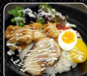
R3. COMBO DON $12.80

Deep fried marinated chicken, served with flavoured egg, salad, pickled vegetables and mayo.