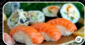
SU9. CHEF'S SPECIAL $8.80