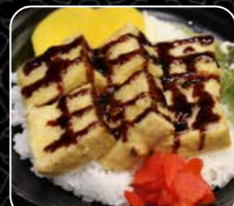
R1. FRIED TOFU DON $10.80

Fried Tofu with Teriyaki sauce on rice, served with pickled vegetables.