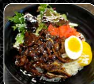
R4. BEEF TERIYAKI DON $12.80

Signature grilled pork belly chashu and deep-fried marinated chicken, served with flavoured egg, salad, pickled vegetables and mayo.