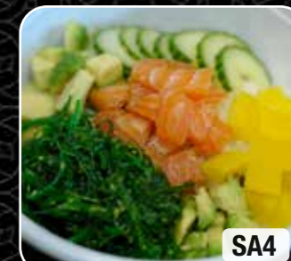
SA4. TASMANIAN SALMON SALAD $7.80

Green Salad with warm prawn tempura & Japanese style dressing