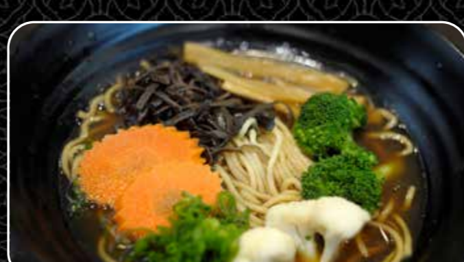
N7. VEGAN SHOYU RAMEN $10.80

Housemade Sapporo Ramen with sesame flavoured pork soup, topped with miso minced pork, flavoured egg, spring onion, marinated egg, flavoured black fungus, bamboo shoots, naruto & housemade chili oil.