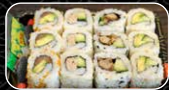
SU1. INSIDE OUT ROLL BOX $8.80