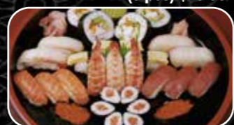
SU17. SUSHI COMBO (32 pcs) $38.80