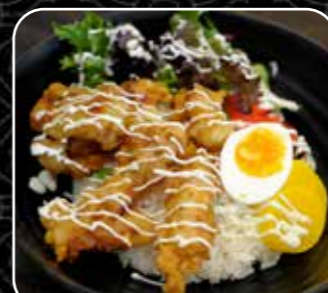
R2. KARAGE DON $12.80

Fried Tofu with Teriyaki sauce on rice, served with pickled vegetables.