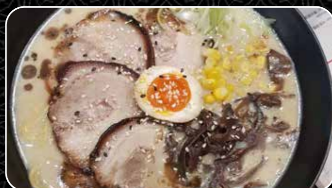
N5. BLACK TONKOTSU RAMEN $15.80

Housemade Sapporo (thick and chewy in texture) Ramen in Japanese bean-paste pork soup. Topped with spring onion, marinated egg, signature grilled pork belly chashu, flavoured black fungus, bamboo shoots, naruto.