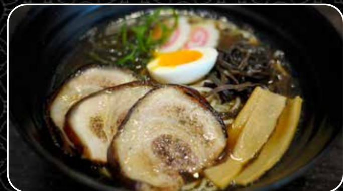
N3. TONKOTSU SHOYU RAMEN $15.80

Housemade Hakata Ramen with spicy seasoning in Tonkotsu soup base. Served with spring onion, marinated egg, signature grilled pork belly chashu, flavoured black fungus, bamboo shoots, naruto.