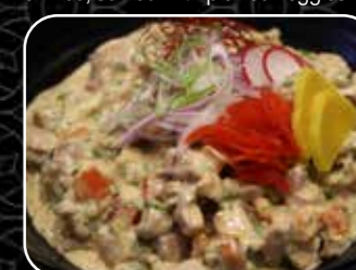
R10. TORI GARLIC YAKI RICE $11.80

Grilled chicken with teriyaki sauce on rice with one bowl of free miso soup