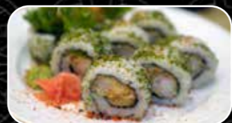
SU13. SPICY CRUNCHY TEMPURA (8 pcs) $13.80