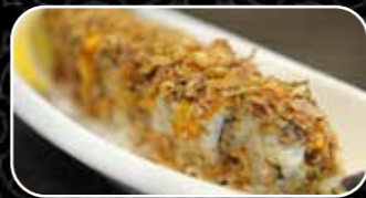
SU6. CRISPY TERIYAKI SALMON ROLLS $12.80