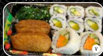
SU10. VEGETERIAN BOX $8.80