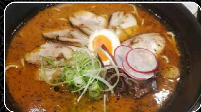
N2. SPICY TONKOTSU RAMEN $15.80

Our signature housemade Hakata Ramen in Tonkotsu soup base (pork broth). Served with spring onion, marinated egg, signature grilled pork belly chashu, flavoured black fungus, bamboo shoots, naruto.