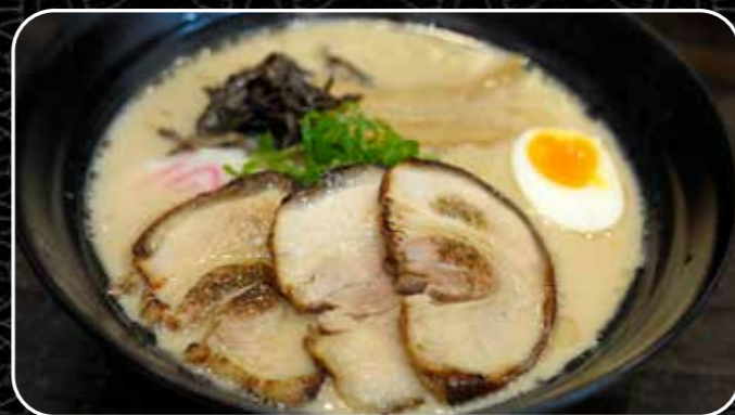
N4. TONKOTSU MISO RAMEN $15.80

Housemade Hakata Ramen with rich white pork and Japanese soy sauce soup. Topped with spring onion, marinated egg, signature grilled pork belly chashu, flavoured black fungus, bamboo shoots, naruto.