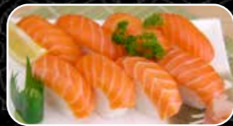
SU8. SALMON NIGIRI SUSHI (8 pcs) $9.80