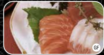
SU3. ASSORTED SASHIMI (10 pcs) $10.80