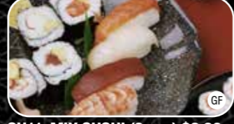
SU11. MIX SUSHI (8 pcs) $8.80