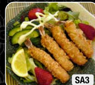
SA3. WARM PRAWN TEMPURA SALAD $9.80

Green Salad with warm prawn tempura & Japanese style dressing