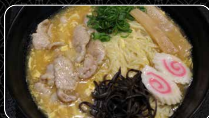
N9. HOUSE SPICY RAMEN $14.80

Housemade Sapporo noodles, flavoured with Japanese soy sauce and flavoured oils and served with miso minced pork, chives, flavoured black fungus and flavoured egg.