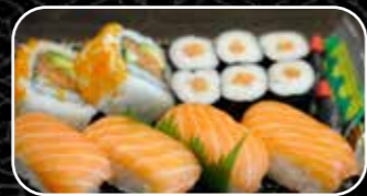
SU7. SALMON DELUXE BOX $11.80