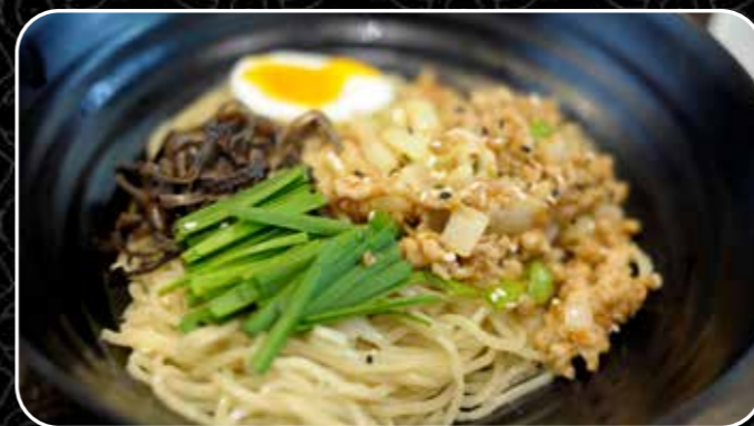
N8. CHILLED MAZEMEN (COLD NOODLES) $14.80

Housemade Sapporo noodles with vegetables and Japanese soy sauce soup is topped with spring onion, carrot, cauliflower, broccoli, flavoured black fungus, bamboo shoots.