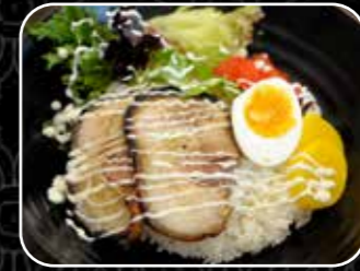
R7. CHASHU DON $12.80

Crumbed chicken/pork in curry sauce on rice with salad and (vegetarian option available: cauliflower, carrot, fresh tofu, broccoli instead of chicken/pork)