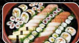
SU18. COMBINATION SUSHI PLATTER 36 pcs $33.00 48 pcs $41.80 64 pcs $54.80