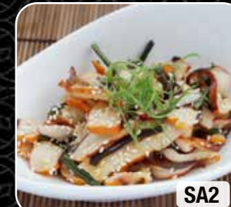
SA2. SQUID SALAD $5.80

Green Salad with warm prawn tempura & Japanese style dressing