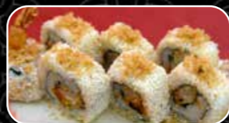
SU14. CRUNCHY TEMPURA ROLL (8 pcs) $13.80