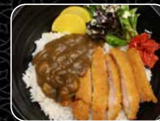
R6. CHICKEN / PORK KATSU CURRY RICE $11.80

Crumbed pork cooked with onion and egg on rice and topped with pickled radish, spring onion and seaweed.