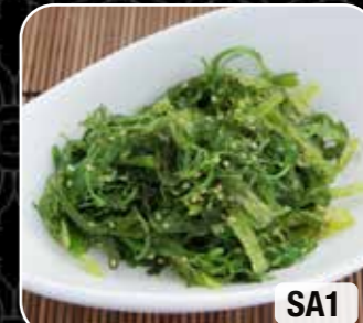
SA1. SEAWEED SALAD $4.80

Green Salad with warm prawn tempura & Japanese style dressing