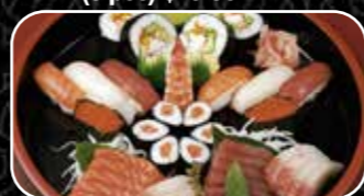
SU16. HOUSE SPECIAL (36 pcs) $42.80