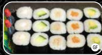
SU2. MINI ROLL BOX $6.80