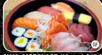
SU12. MORIWASE (19 pcs) $18.80