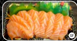
SU4. SALMON SASHIMI (8 pcs) $8.80