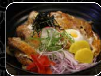
R5. KATSU DON $11.80

Sliced beef and onion with teriyaki sauce, topped with salad mayonnaise, flavoured egg and pickled radish.