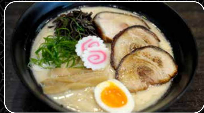
N1. HOUSE RAMEN $15.80

(5) Black Tonkotsu Soup Our special Japanese sauce with our collagen-filled Tonkotsu broth.