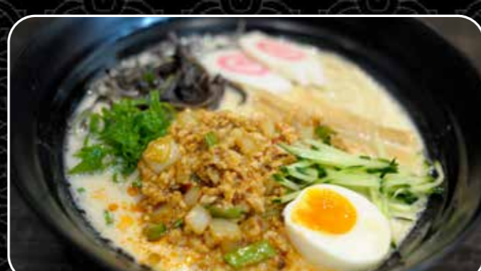
N6. TAN TAN MEN $15.80

Housemade Hakata Ramen with our special fried garlic & black sesame paste, topping with spring onion, marinated egg, signature grilled pork belly chashu, flavoured black fungus, bamboo shoots, naruto.